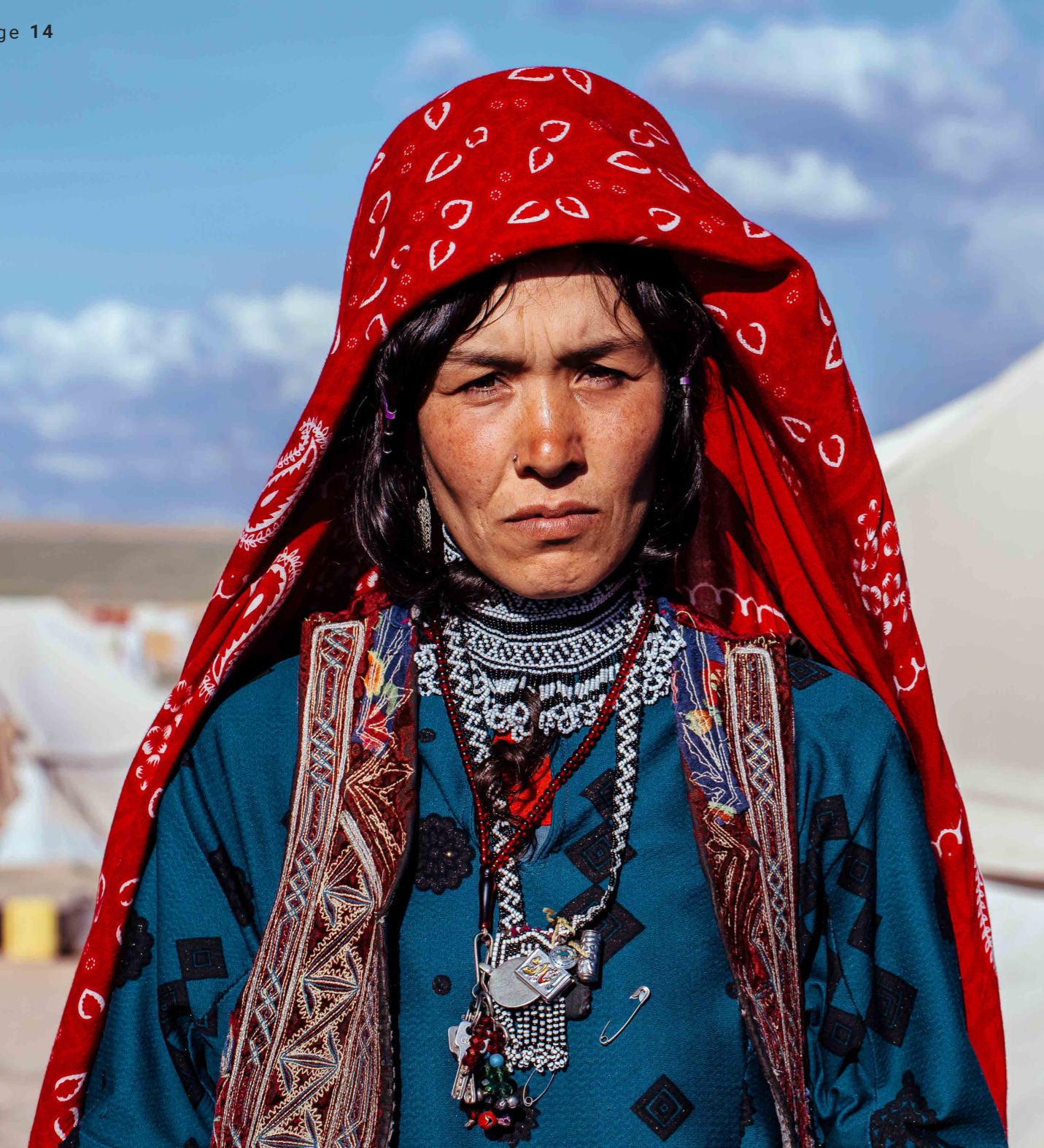
Portrait of a woman in Sheidai district in Herat province