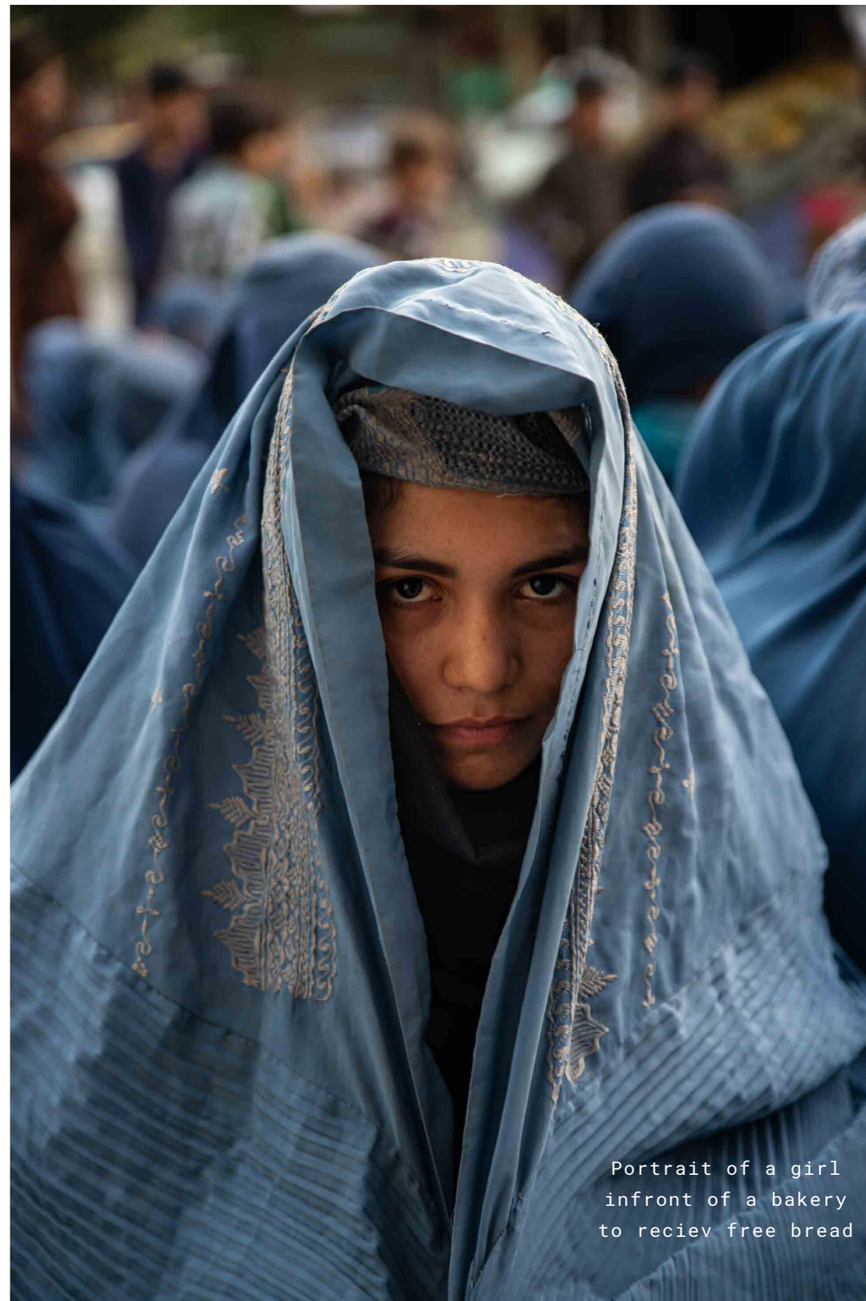
Portrait of a girl infront of a bakery to reciev free bread