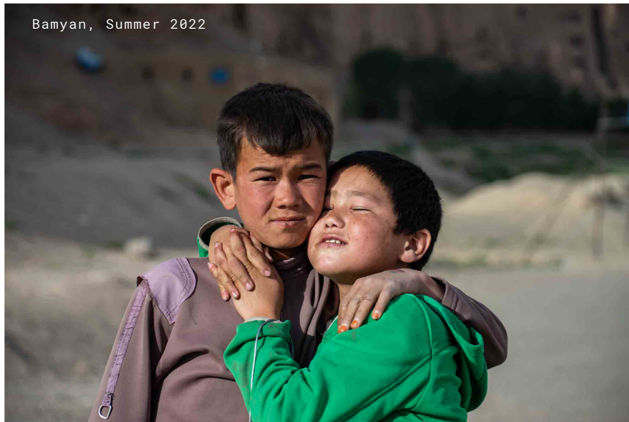
Bamyan, Summer 2022