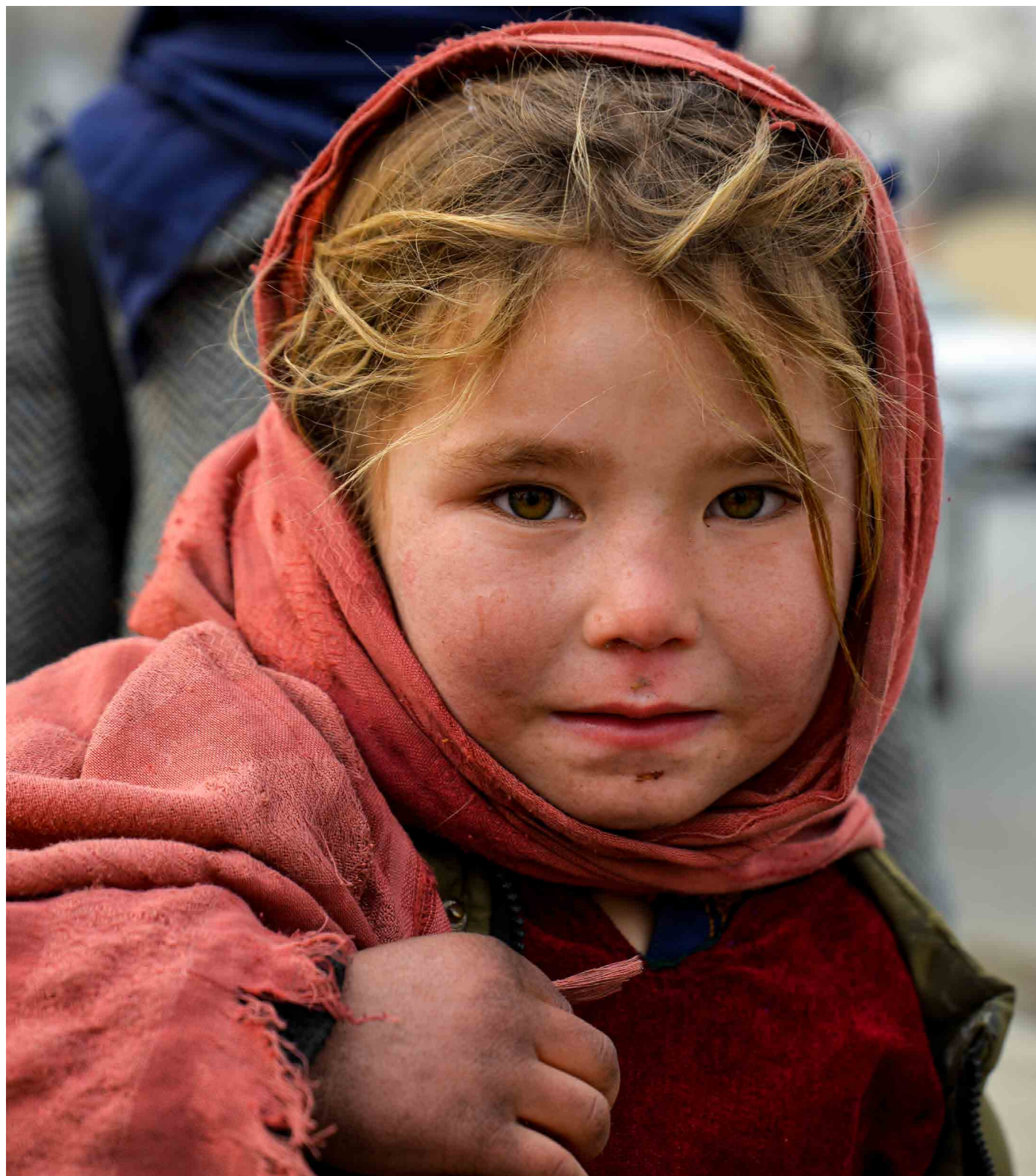
A girl from Kabul, winter 2022