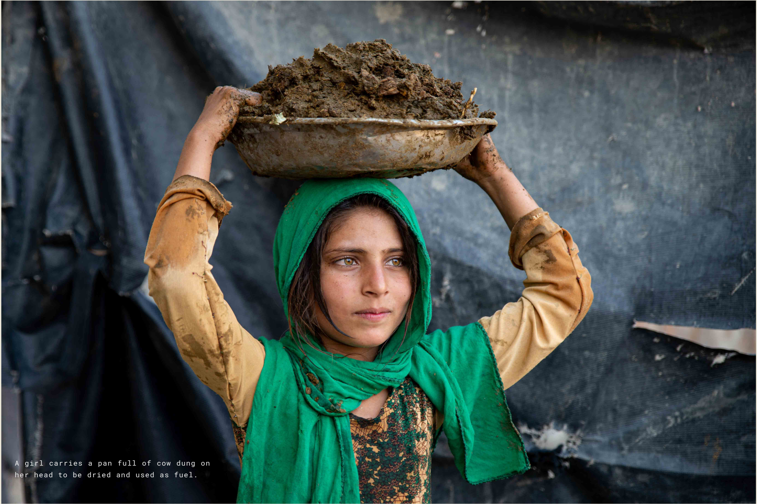
A girl carries a pan full of cow dung on her head to be dried and used as fuel.