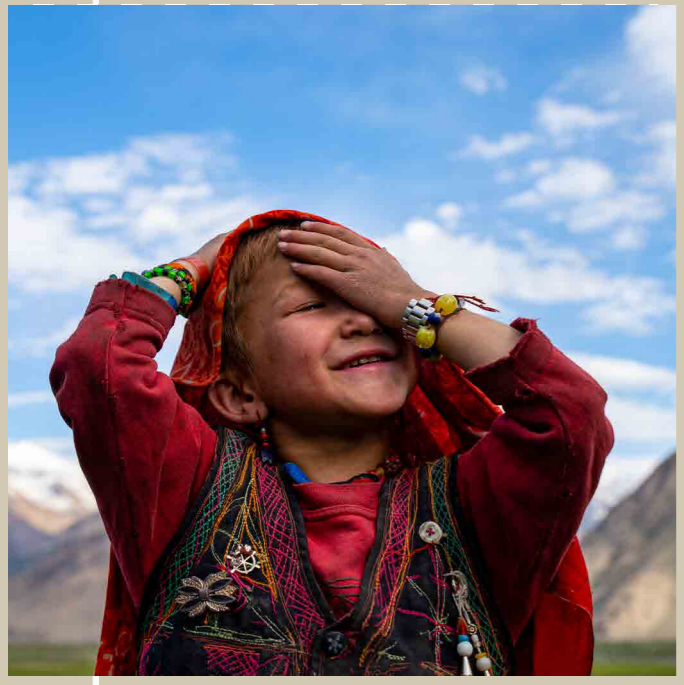
Wakhan Corridor, Summer 2019