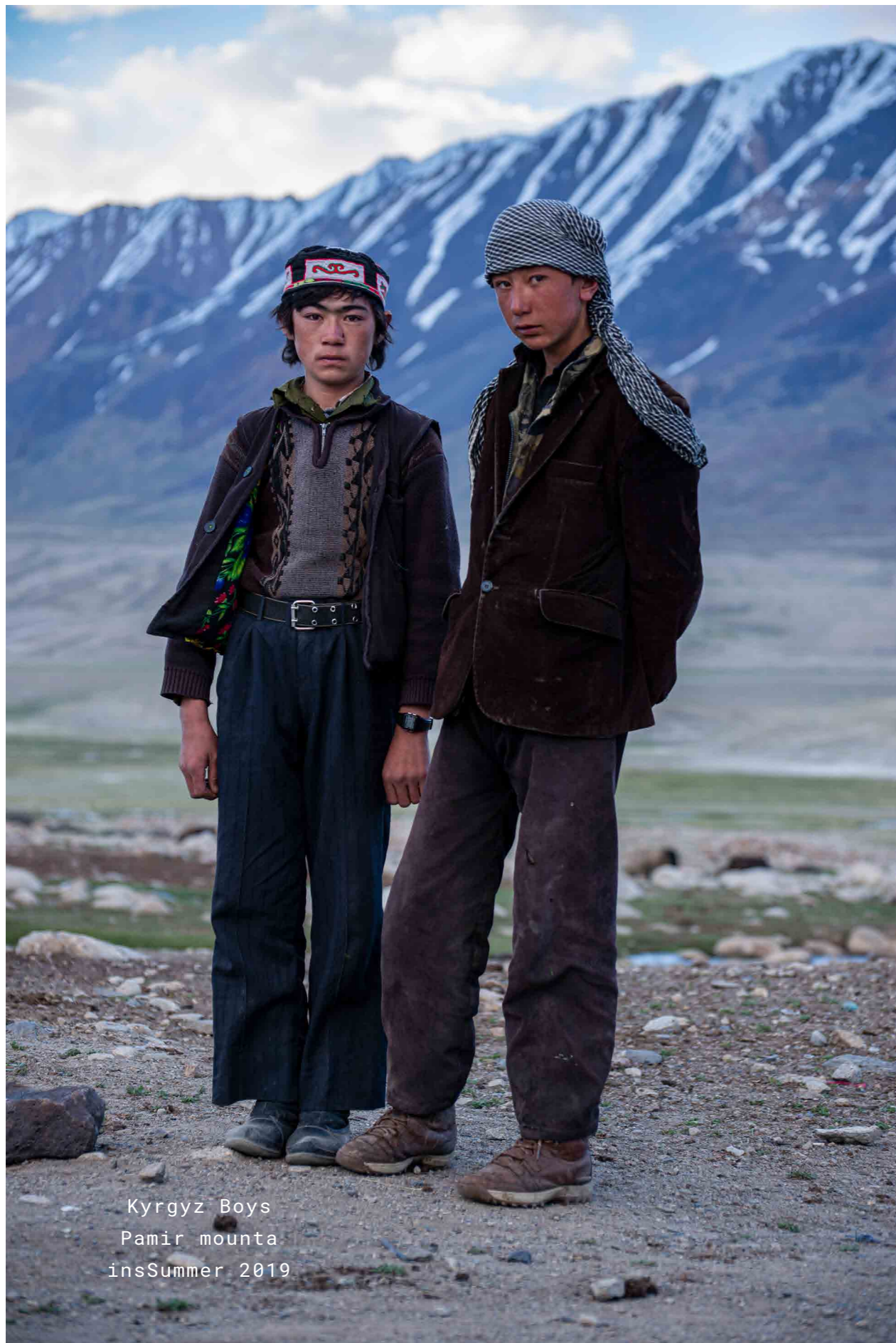
Kyrgyz Boys Pamir mounta insSummer 2019