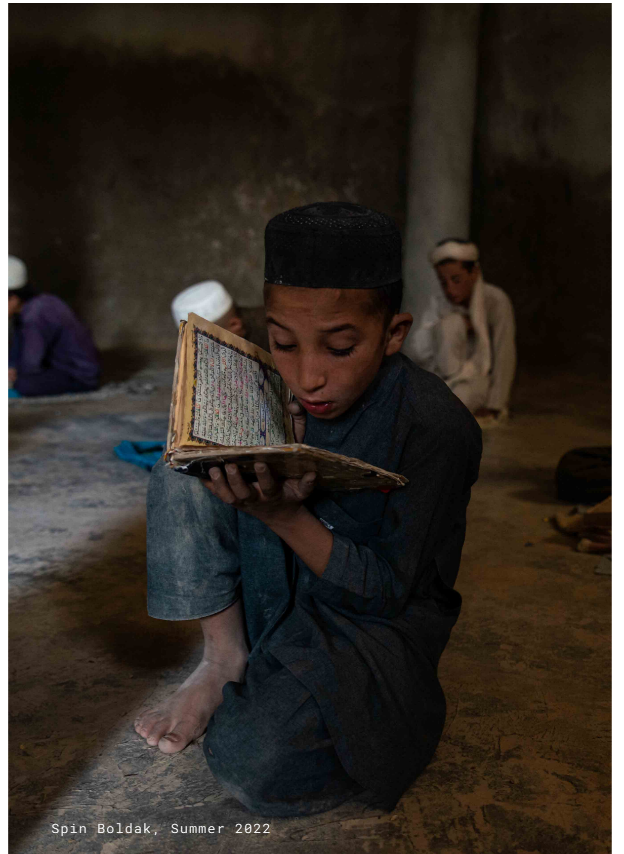
Spin Boldak, Summer 2022