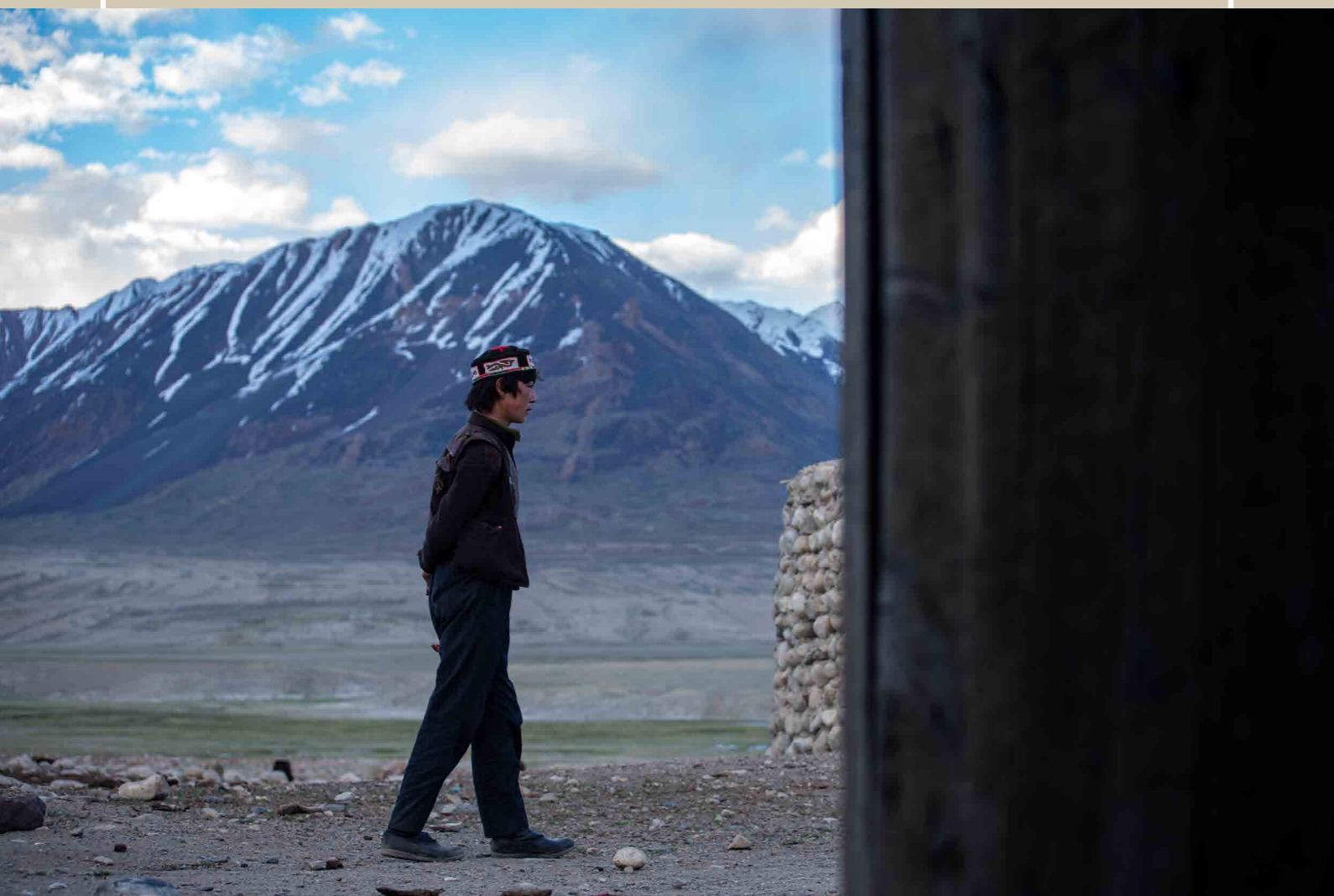
A boy from the Kyrgyz trib in the Pamir mountains.