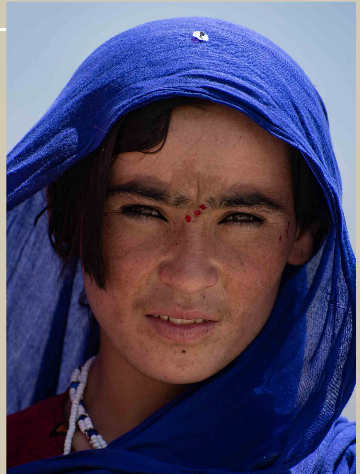
Delbar - Badakhshan