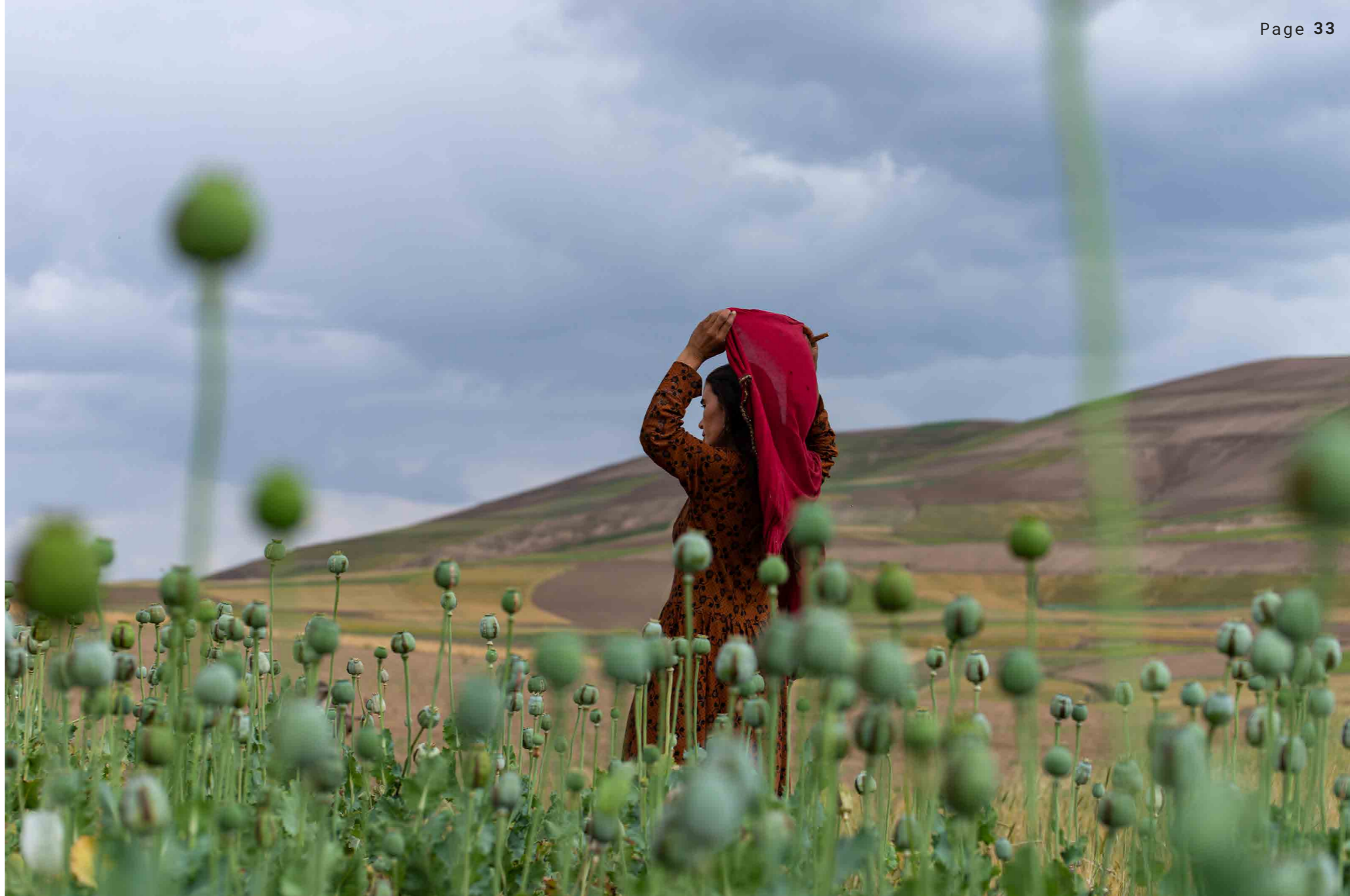
A woman standing in the middle of a poppy field. Badakhshan, 2022