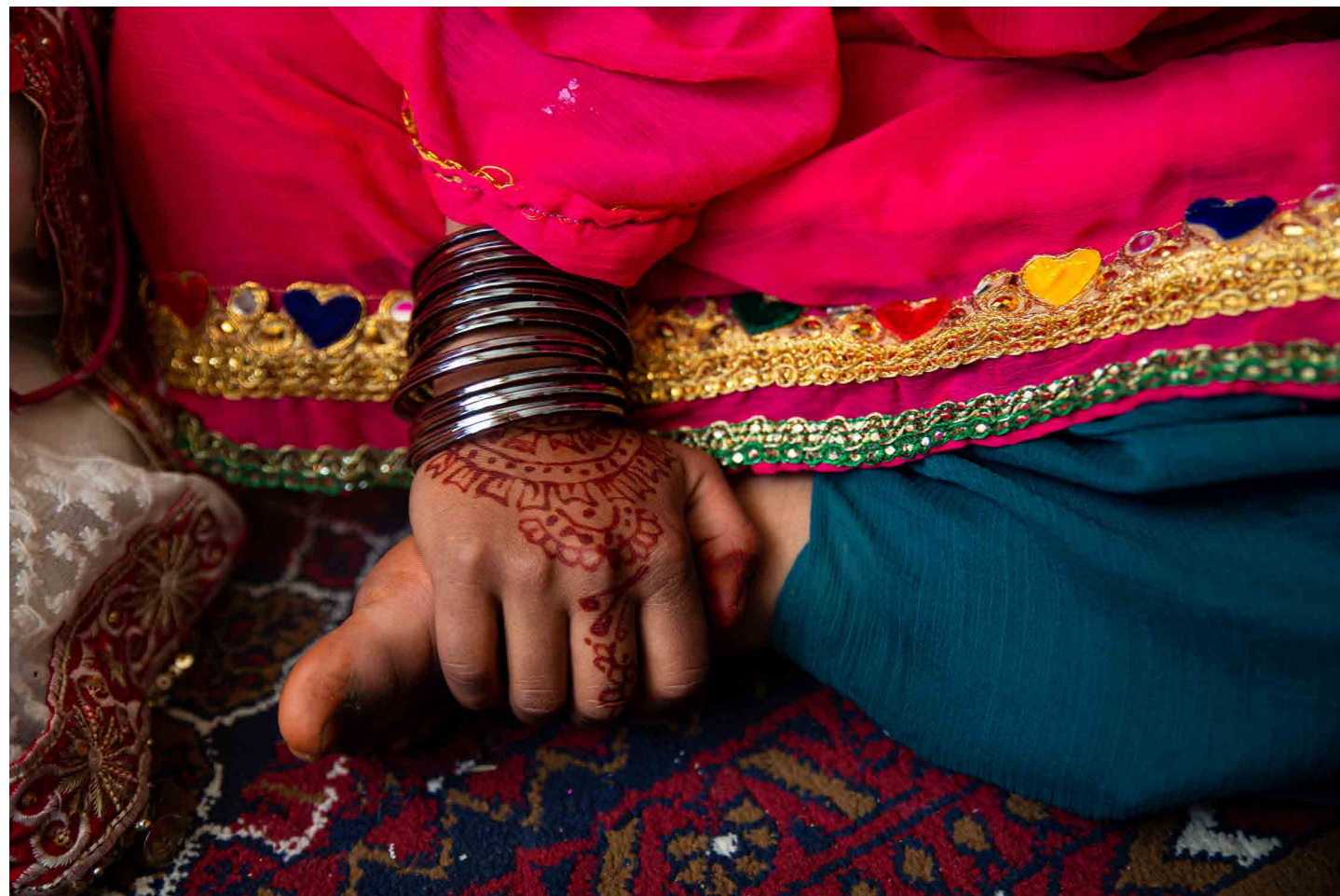
An engagement ceremony without a groom Kabul, 2022

The groom is not present in this engagement ceremony. Someone from the groom's family becomes the groom's lawyer so that the bride can tell him her answer.