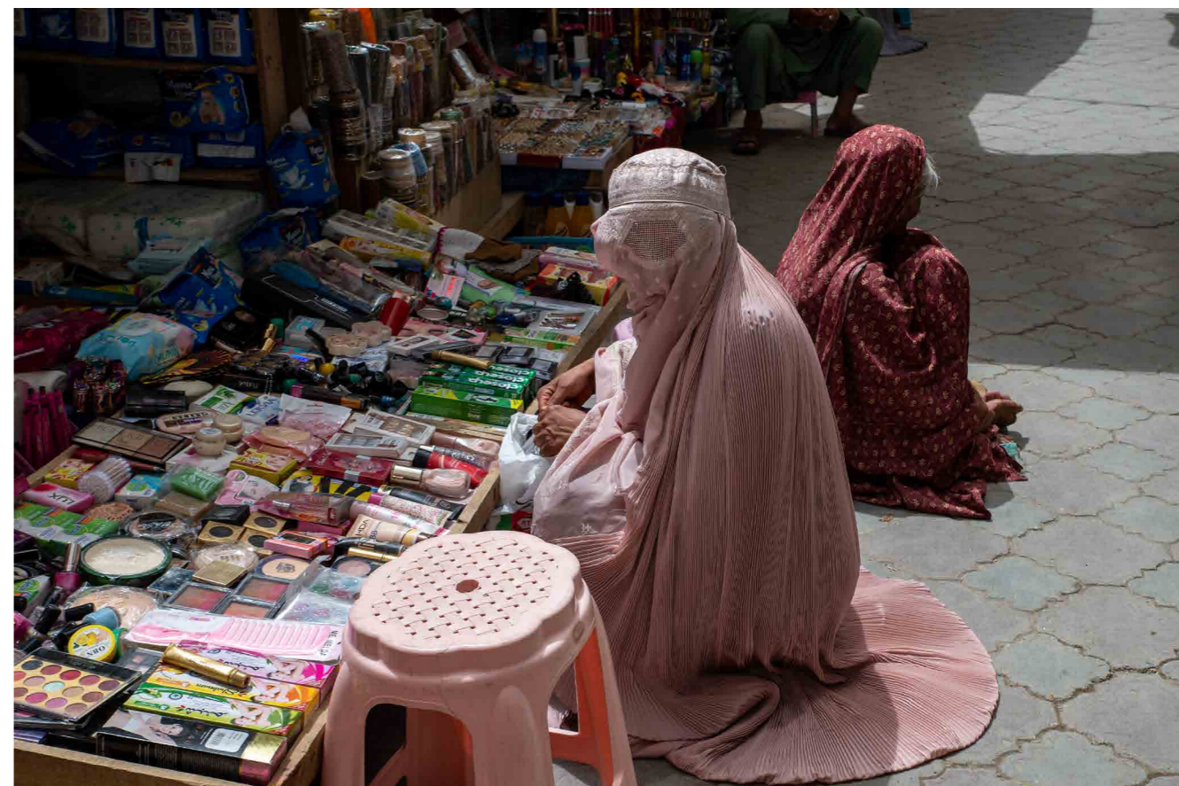
Women wearing burqas buy cosmetics in Kandahar