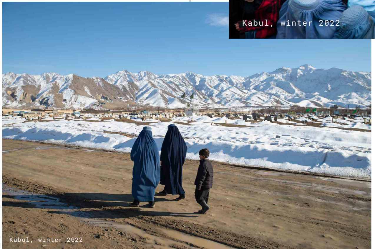
Kabul, winter 2022