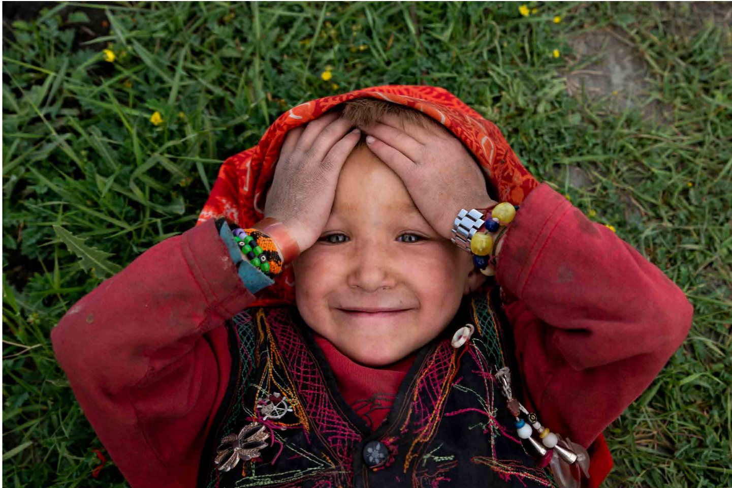
A Wakhi girl Sarhad Broghil, Wakhan Corridor, 2019