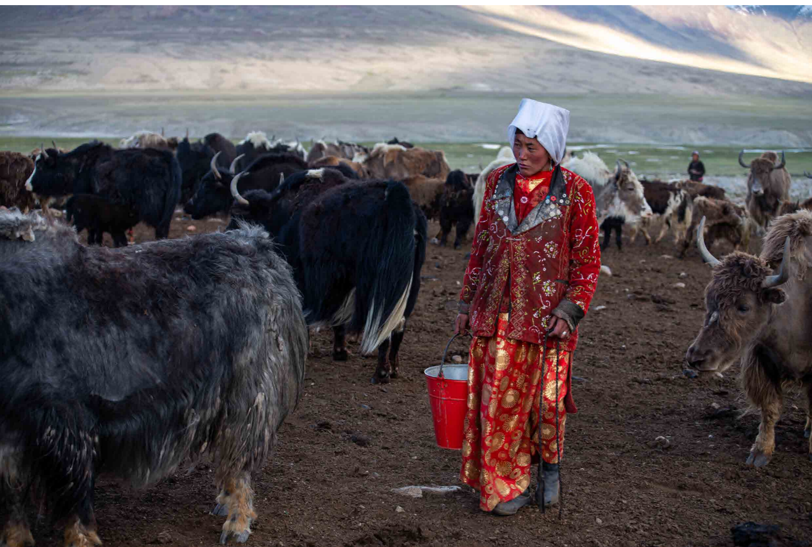
Kyrgyz people Pamir Mountains, 2019