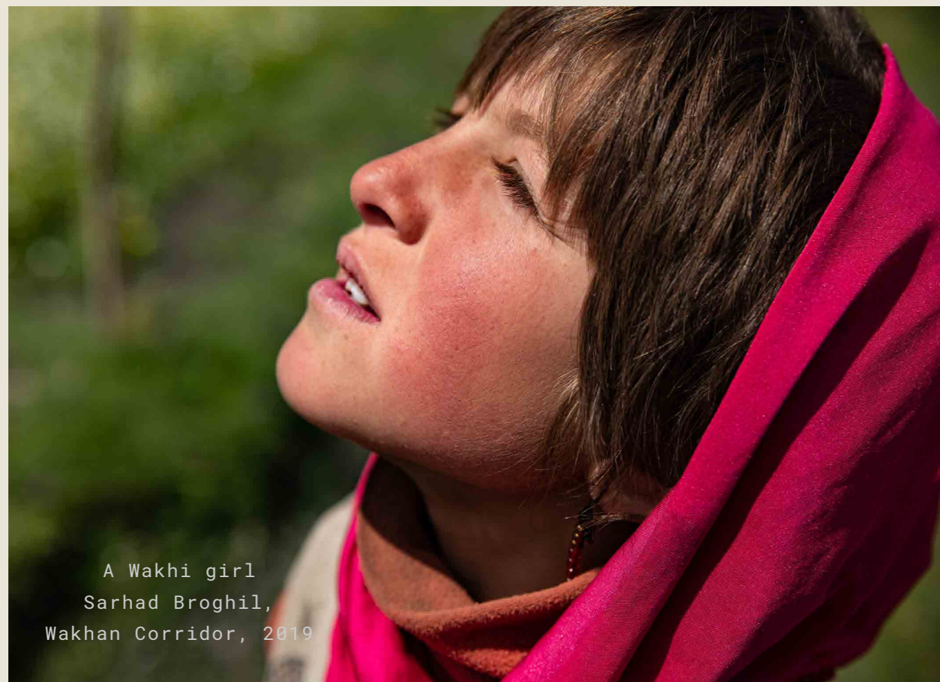
A Wakhi girl Sarhad Broghil, Wakhan Corridor, 2019