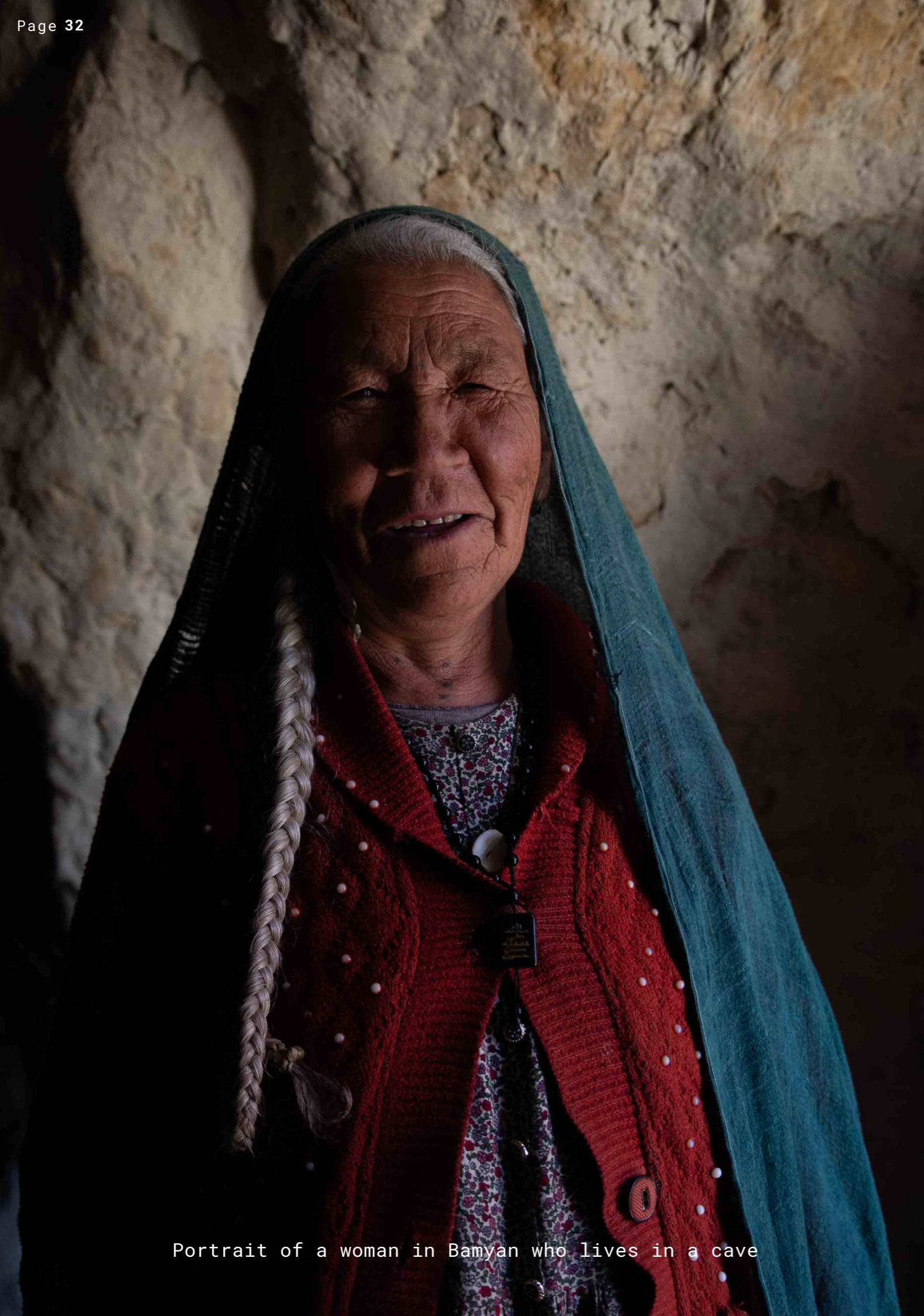
Portrait of a woman in Banyan who lives in a cave