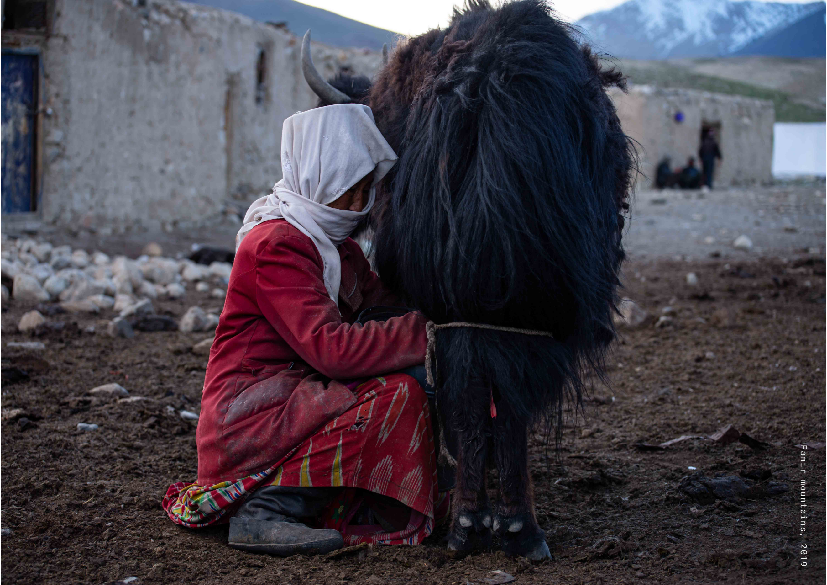
Pamir mountains, 2019