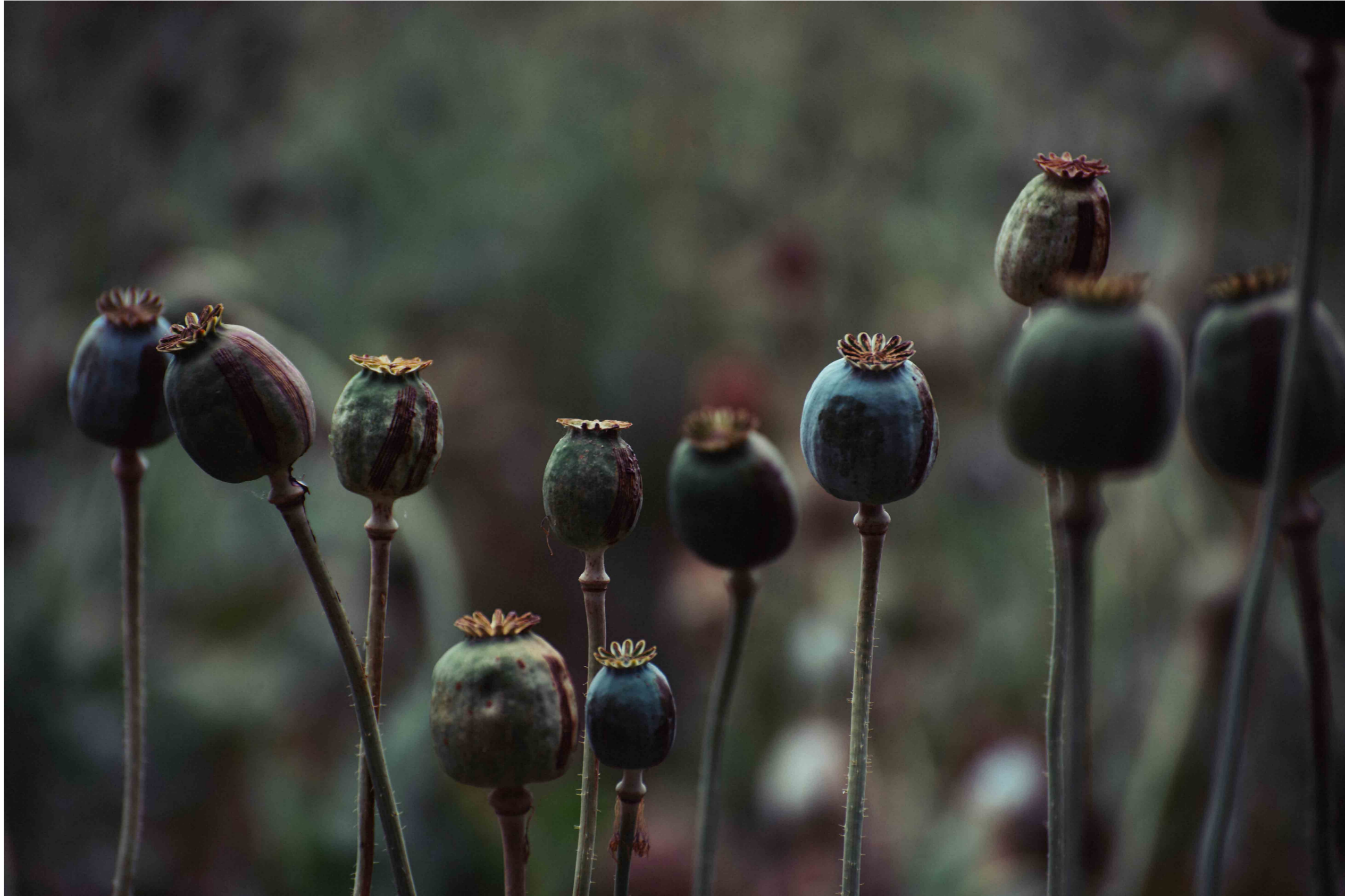
Poppy field in Badakhshan