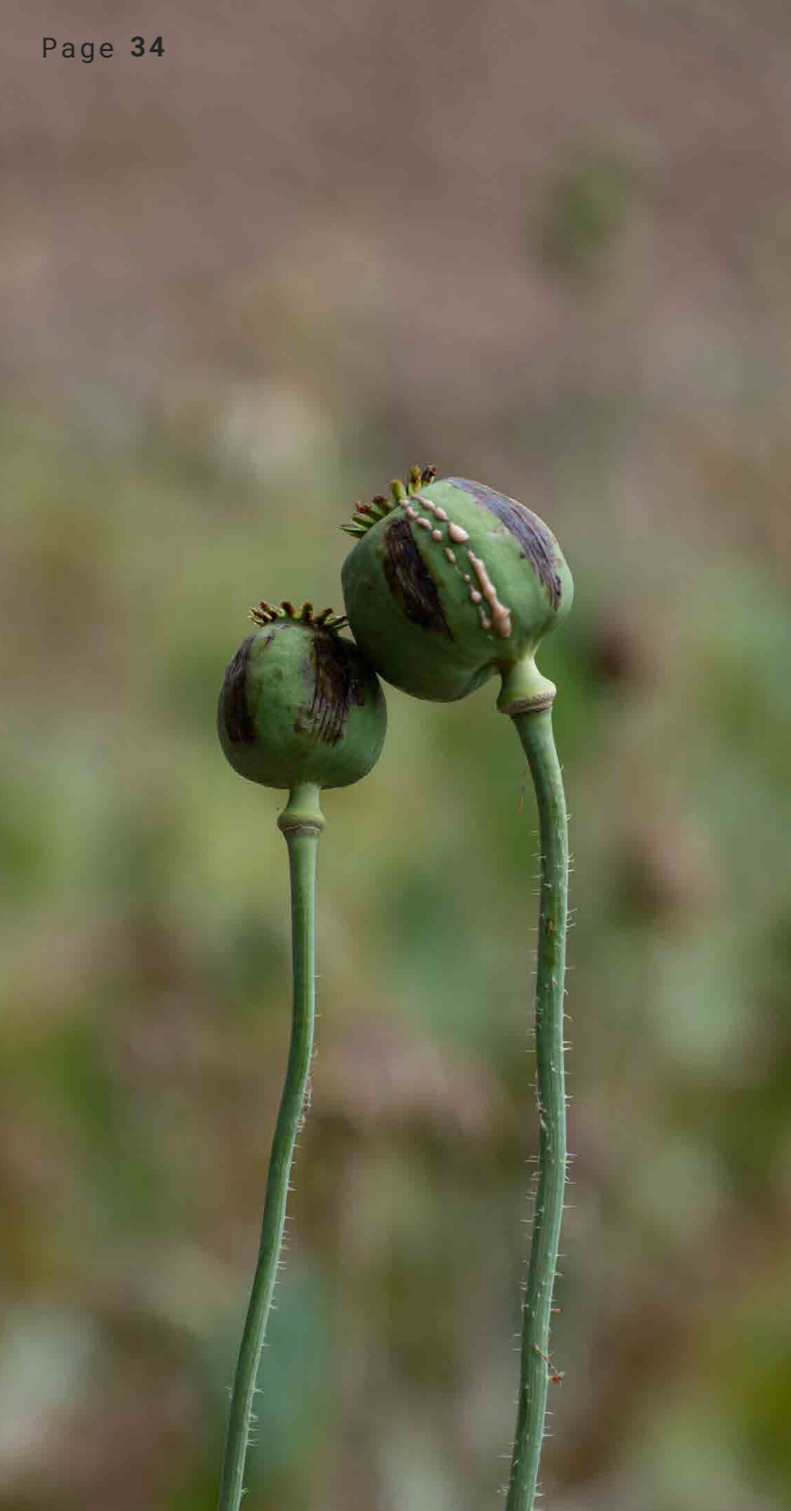
Poppy field, Badakhshan, 2019