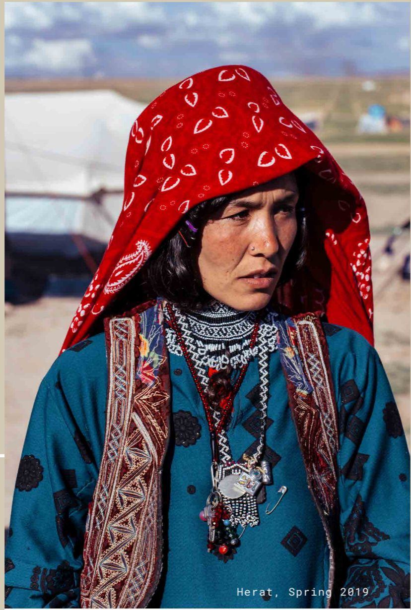
Herat, Spring 2019

These photos were taken in one of the Kyrgyz tribes in the Pamir mountains. To reach this people, I walked in the mountains for seven days and nights and came back.