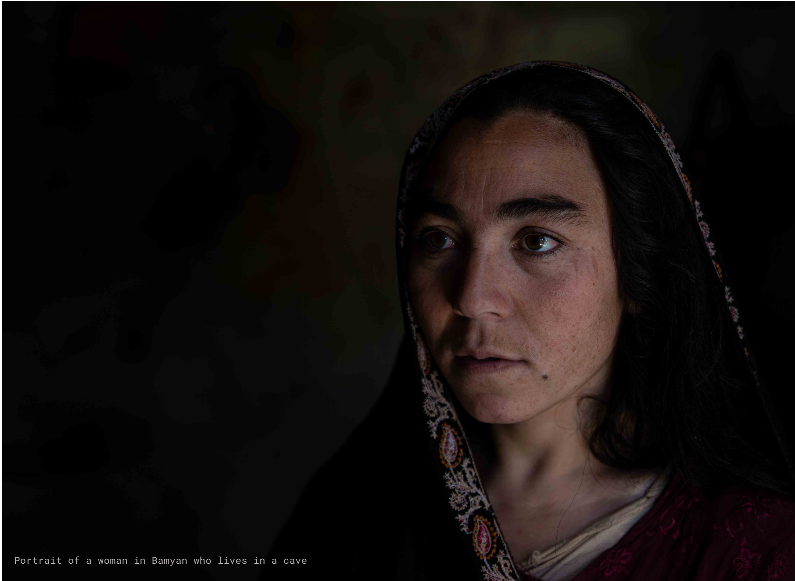
Portrait of a woman in Bamyan who lives in a cave