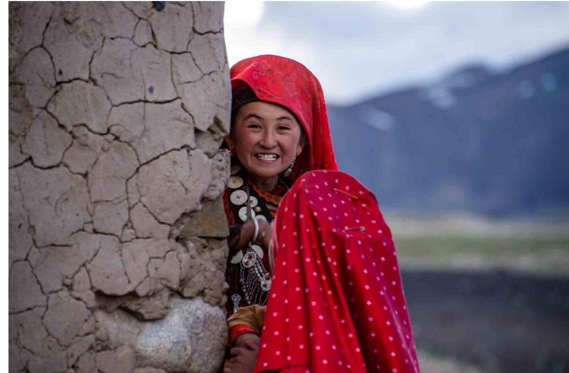
Kyrgyz People, Pamir mountains, Summer 2019