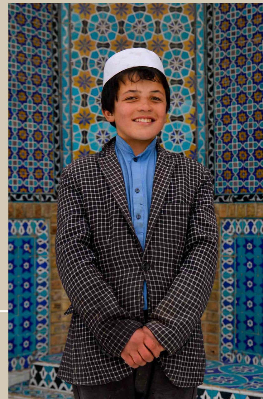
A boy in Sakhi Mosque Mazar-i-Sharif, Spring 2022