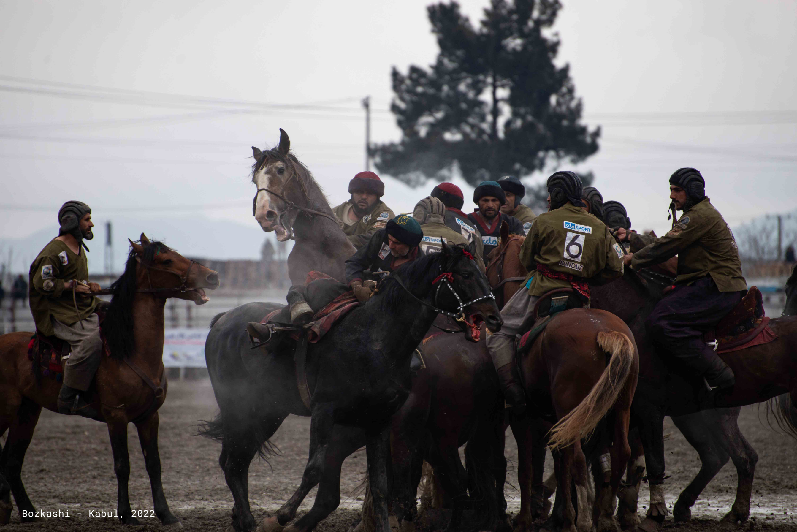
Bozkashi - Kabul, 2022