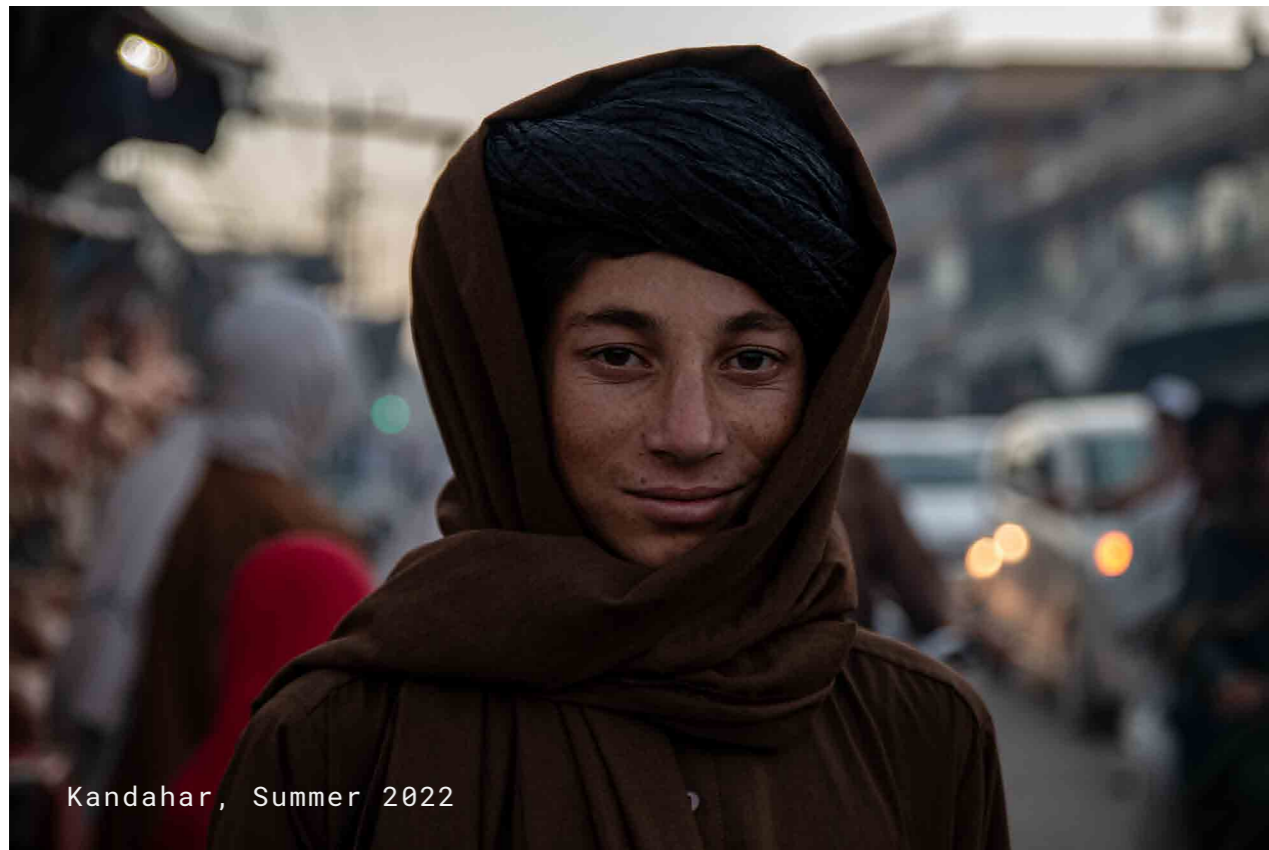
Kandahar, Summer 2022