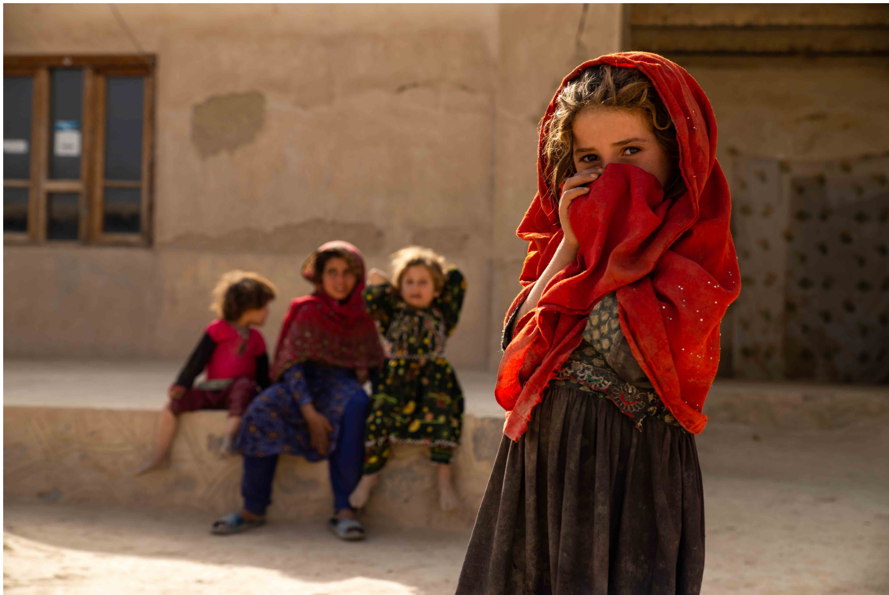
A girl in the Mullah Omar's Mosque and School in Kandahar