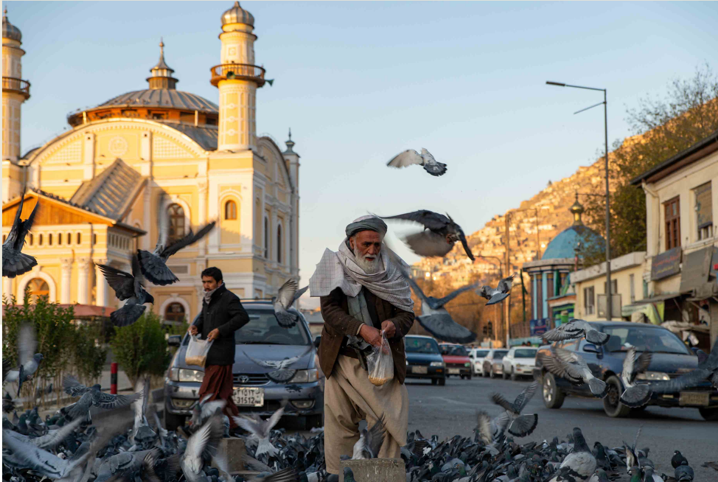
Shah-E do shamshirah mosque Kabul Autumn 2021