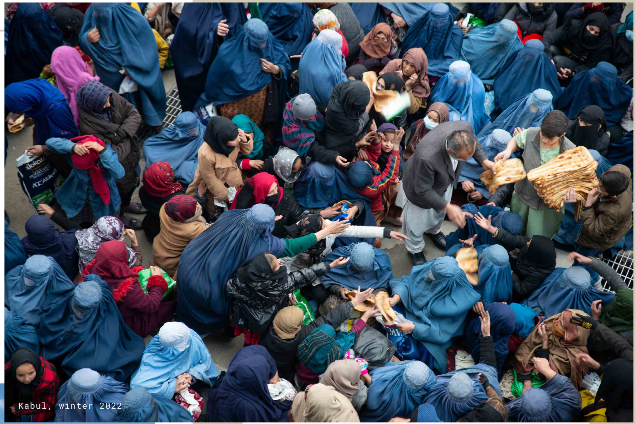
Kabul, winter 2022