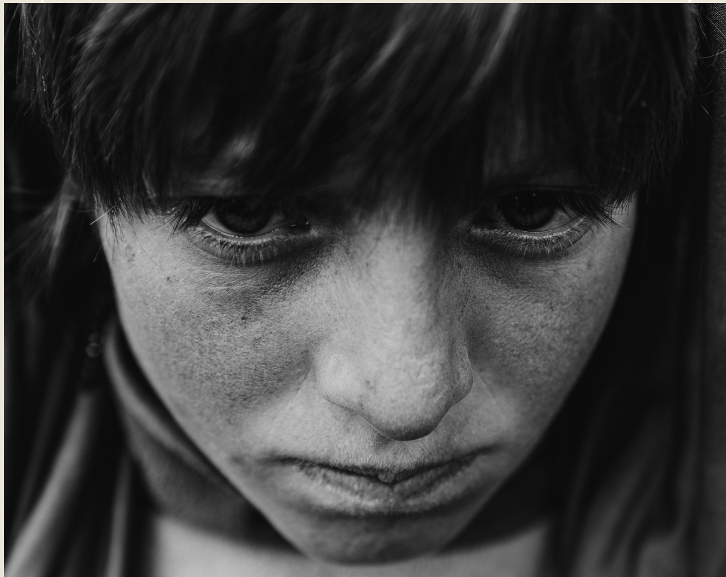
A Wakhi girl Sarhad Broghil, Wakhan Corridor, 2019